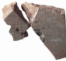
Tel Dan Inscription

Through the years, critics of the reliability of the Bible have made claims, such as: Moses could not have written the Pentateuch, as writing had not been invented at that time; the Hittites were not real, but had been made up by the Bible writers; King David, King Belshazzar, King Herod, and Pontius Pilate never existed; and the story of Joshua and the Israelites at Jericho could not be true, as Jericho did not exist at that time. These claims (and others) have been disproved by archeological discoveries (for instance: coins with King Herod's name, historical writings speaking of Pontius Pilate, stone fragments called the "Tel Dan inscription" that describe the "house of David," and stone tablets with writing dated before the time of Moses have been found). These discoveries, further proving the stories of the Bible, should strengthen your belief and faith in the Bible!