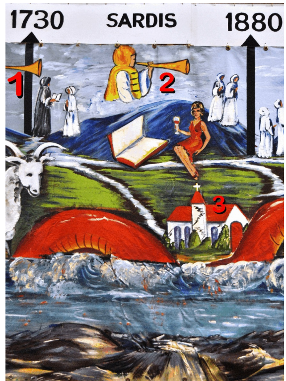
Reference Text: Revelation 3:1-6