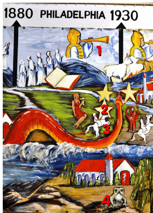
Reference Text: Revelation 3:7-13