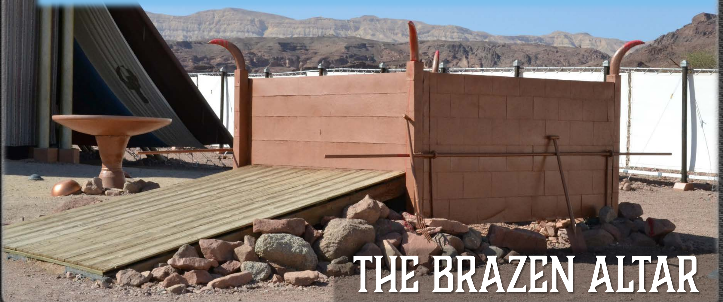
THE BRAZEN ALTAR